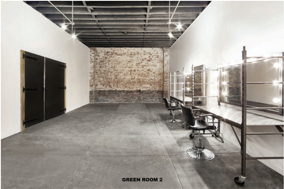
GREEN ROOM 2